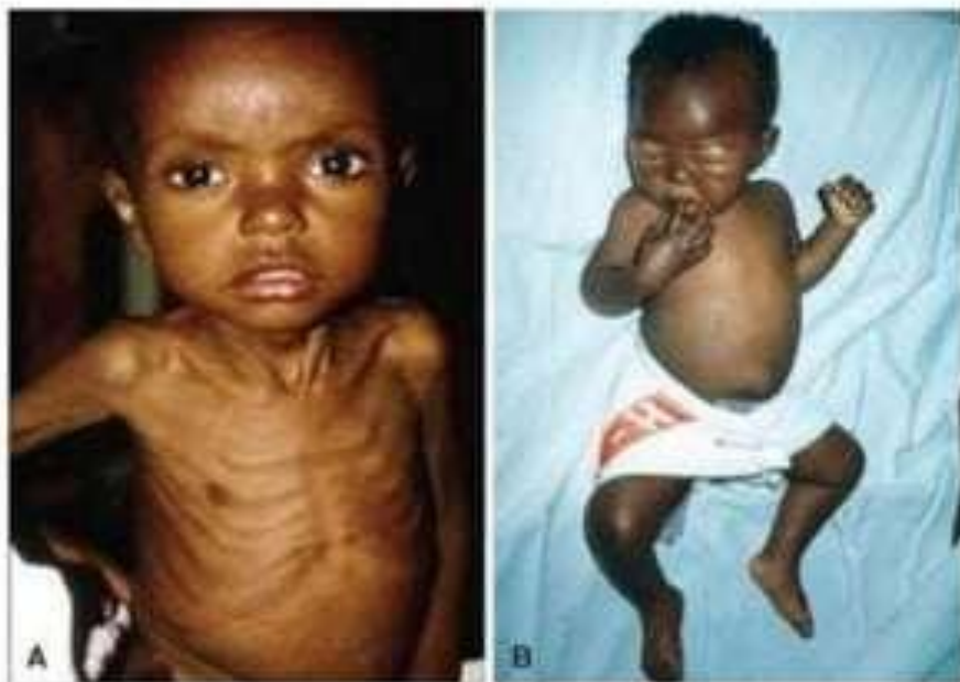
FIGURE 9-23 Childhood malnutrition. A, Marasmus. Note the loss of muscle mass and subcutaneous fat; the head appears to be too large for the emaciated body. B, Kwashiorkor. The infant shows generalized edema, such as swelling and puffiness of the face, hands, and legs.